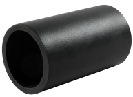
SL PPS buis